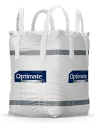
PACK SIZE: 20KG / 250KG