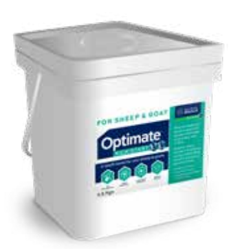
PACK SIZE: 2.5KG

Natural health improver that can be given to individual animals.