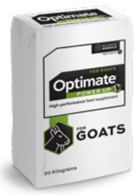
PACK SIZE: 20KG / 1000KG