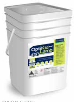
PACK SIZE: 20L / 500KG