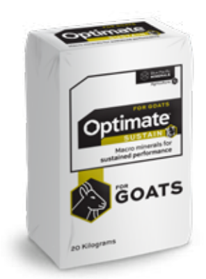
PACK SIZE: 20KG / 1000KG